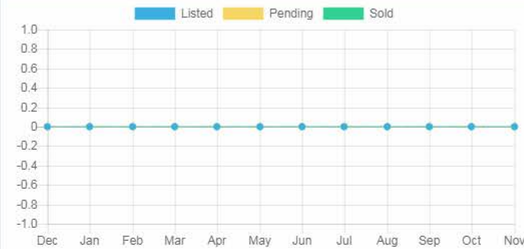
Listings Status per Month